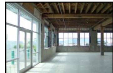
Floor One: 1,736 SF & 5,686 Divisible SF