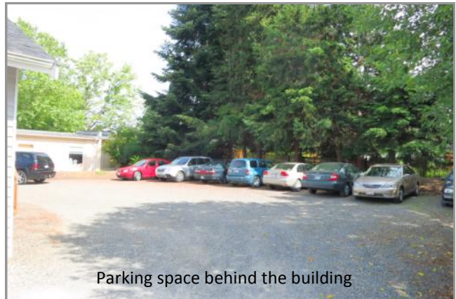
Parking space behind the building