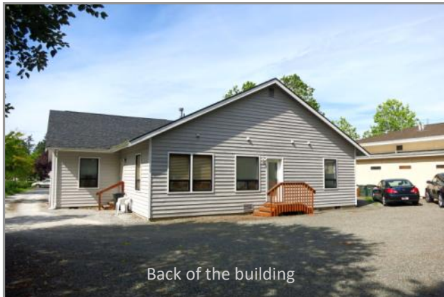
Back of the building