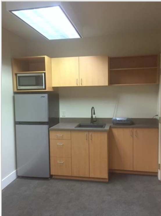
SUITE 311 THREE PRIVATE OFFICES WITH KITCHENETTE AND OPEN RECEPTION