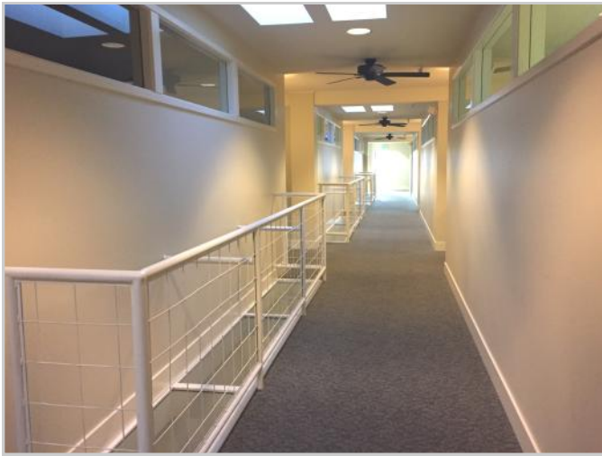
3RD FLOOR HALLWAY