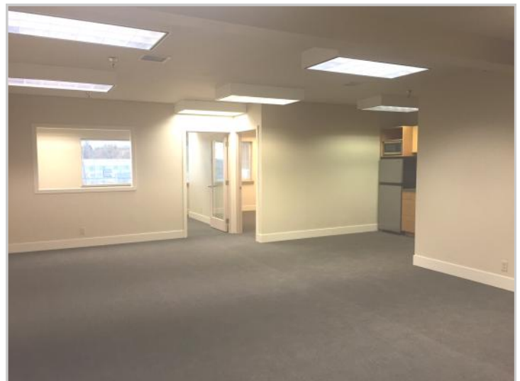
GREAT WORKING ENVIRONMENT